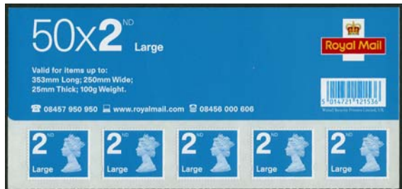
Top Panel Type6 – 2007 Walsall sheets Matrix stripped containing PIP Large NVIs Printer's imprint below barcode