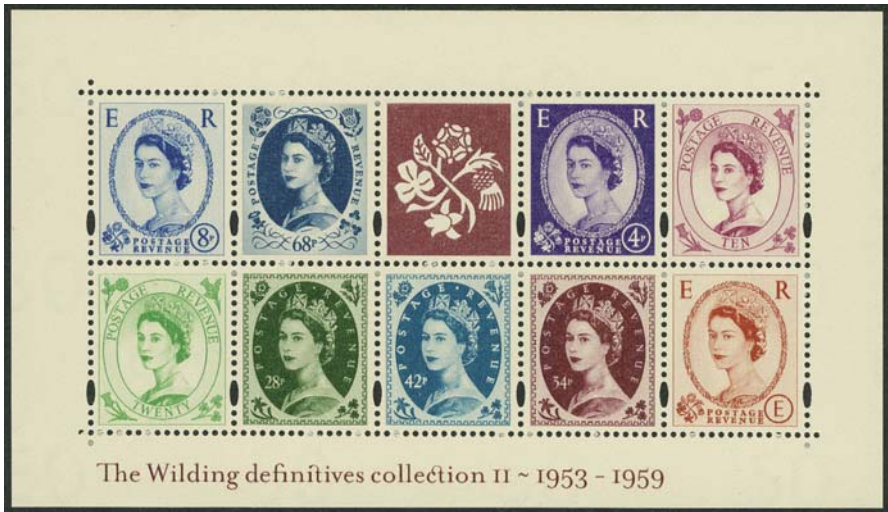
The Wilding definitives collection II ~ 1953 - 1959