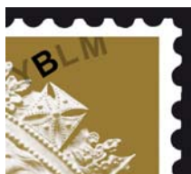
Code B Business sheets

The location of these codings are illustrated in the diagrams below. The code letter is highlighted in darker type and the word it is contained in slightly paler lettering, but this is enhanced to show the positioning – on the actual stamp it is simply part of the normal iridescent overprint. This is a very interesting development and as they are readily identifiable with the naked eye, each will be treated as a basic new stamp. Stamps from conventional sheets of 50 have no code letters and retain the correctly spelled “ROYAL MAIL” in these positions.