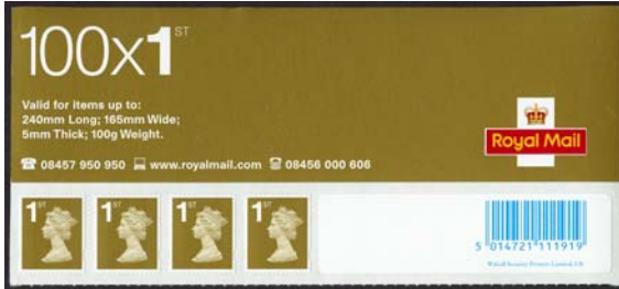
Top Panel Type 5 – 2006 Walsall sheets Matrix stripped containing PIP NVIs