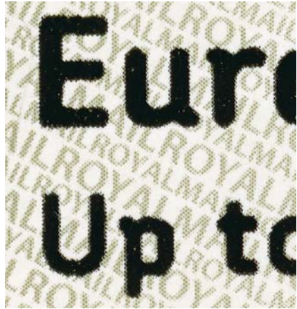
Gravure printed version with screening dots clearly visible