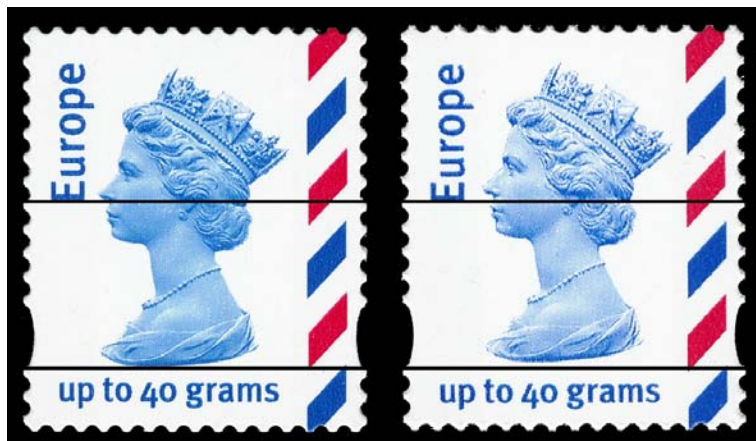
Original Head Setting (ex W1 or W2)