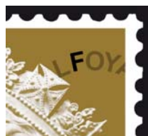
Code F Books of Four