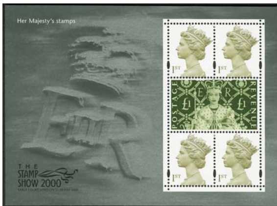
Illustration at 50% of original size

This sheet was issued to mark the StampShow 2000 international stamp exhibition, held at Earl's Court, London in May 2000. It contains 4 x 1st Millennium definitives and a version of the 1953 Coronation 1/3 stamp but revalued £1. It was sold at £2.04. The sheet was printed in gravure by De La Rue on OFPP paper that was left over from the Jeffrey Matthews miniature sheet (see page 13 for further details).