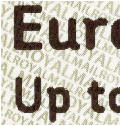
Thermographically printed version with no screening on edges