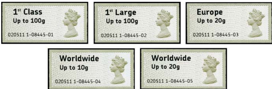
Codes found on all gravure printed Post & Go stamps

ture, with a series of dots clearly visible around the edges of every character. The figures in the coding at the bottom of the stamps appear appreciable thicker and deeper in colour. The biggest giveaway of their source, however, is that being gravure printed it is not possible to change the coding information along the bottom from copy to copy. Instead each value bears the same coding on every example – Royal Mail decided to use the code for the Bristol office as this was where Post & Go stamps were first issued – so they are instantly recognisable. We illustrate all five values below so this coding can be seen.